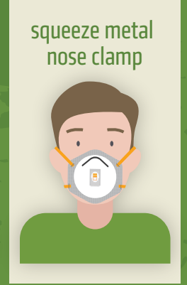
Respirator fit testing information and resources: http://bit.ly/2Gxk6QE